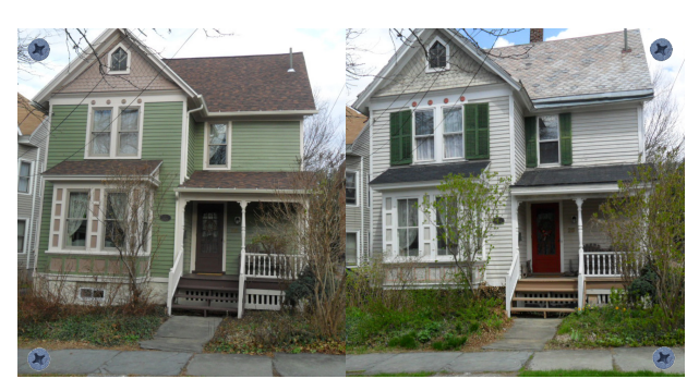
Before & After

A home is one of the biggest purchases most people will ever make. With that, we are often unprepared for what could happen after the purchase. The HomeOwnershipCenter can help make vital repairs and improvements to the home. This can ultimately increase the value of the property while making it more livable, safe and efficient.